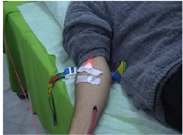
Figure 2. Intravenous Laser Therapy

Through a total of 27 sessions of treatment, the lesions improved completely with highly satisfactory results; and one month after LLLT, as the patient was symptom free, drug-therapy was continued. Alopecia resolved completely and the atrophic lesion improved moderately (Figure 1B). After three months, the lesions flared up again with itching and scaling. A second therapeutic course was done using the same protocol for 12 sessions. During