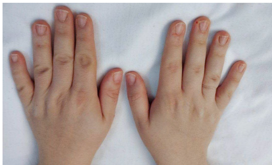
Figure 3. A picture of the same patient's hand after the treatment with herbal combination

dosage of the herbal medicine, as participants applied the compound only once daily to the target area. Although various topical herbal products for eczema containing C. officinalis , C. longa , or G. glabra individually are available on the market, we propose using all four together to harness their cumulative anti-inflammatory and anti-eczema effects.