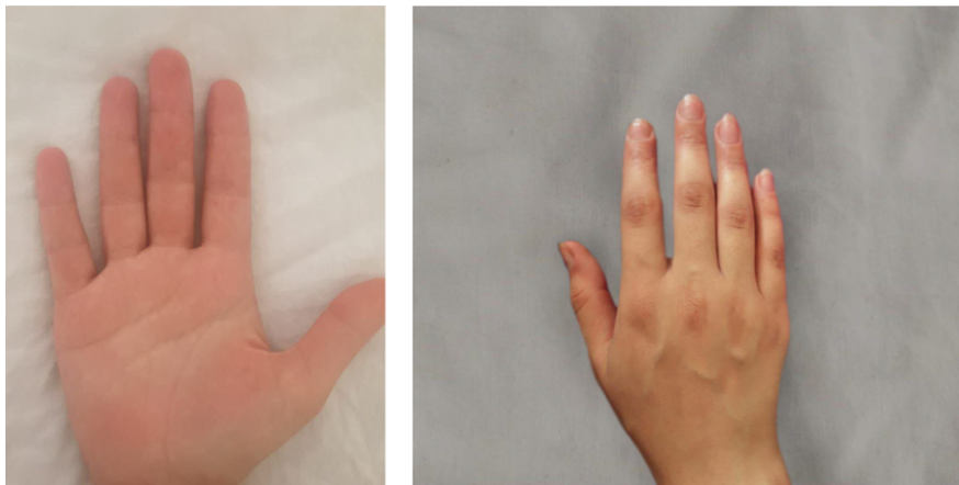
Figure 5. A picture of the same patient's hand after the treatment with mometasone