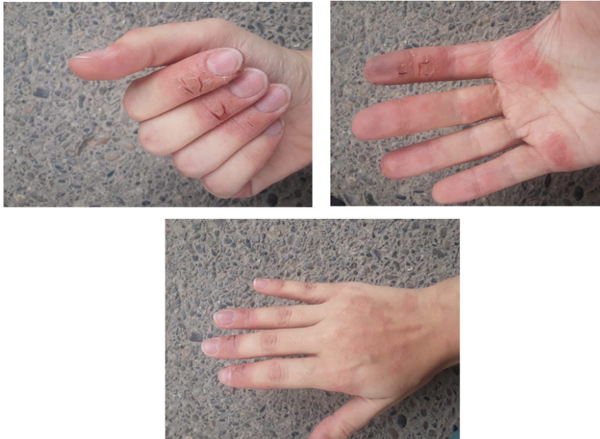
Figure 4. A picture of the patient's hand before starting the treatment with mometasone