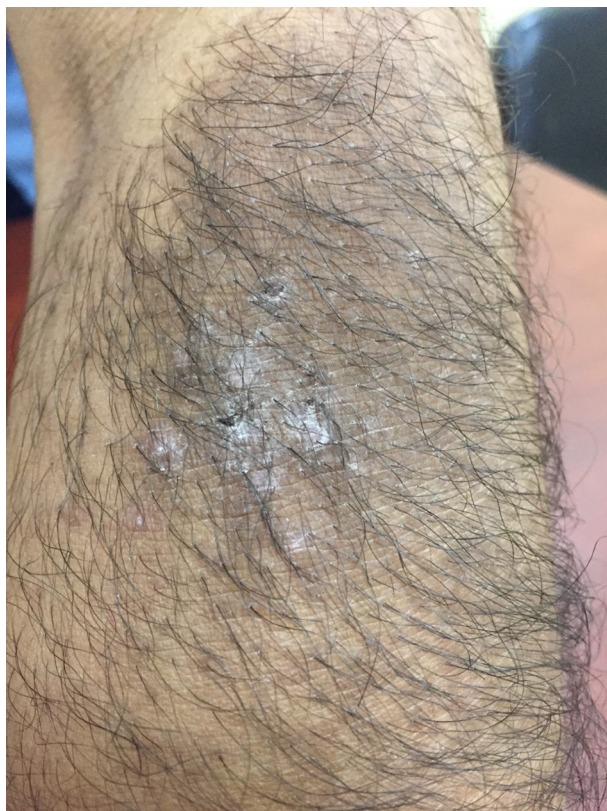
Figure 1. Lichenified papules of lichen simplex chronicus occurring in Becker's nevus

trim his nails, avoid scratching, distract his attention to the lesion, and avoid stresses in general.