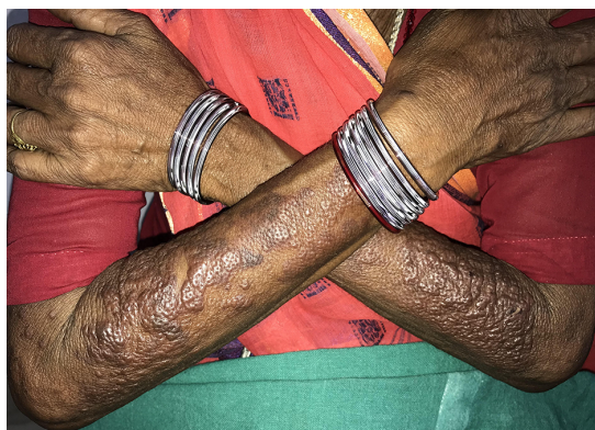
Figure 1. Mammillated skin with smooth papules and nodules coalescing into plaques arranged in band-like fashion on both forearm

Although, elastotic changes in the skin of forearm are rarely reported, the histopathological findings were consistent with the diagnosis of solar elastosis. Therefore, we concluded with the diagnosis of solar elastotic bands of the forearm.