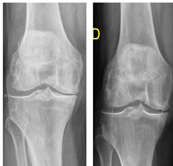
1. Internal compartment measured at the perceived joint narrowest space; 2. External compartment measured at the perceived joint narrowest space.