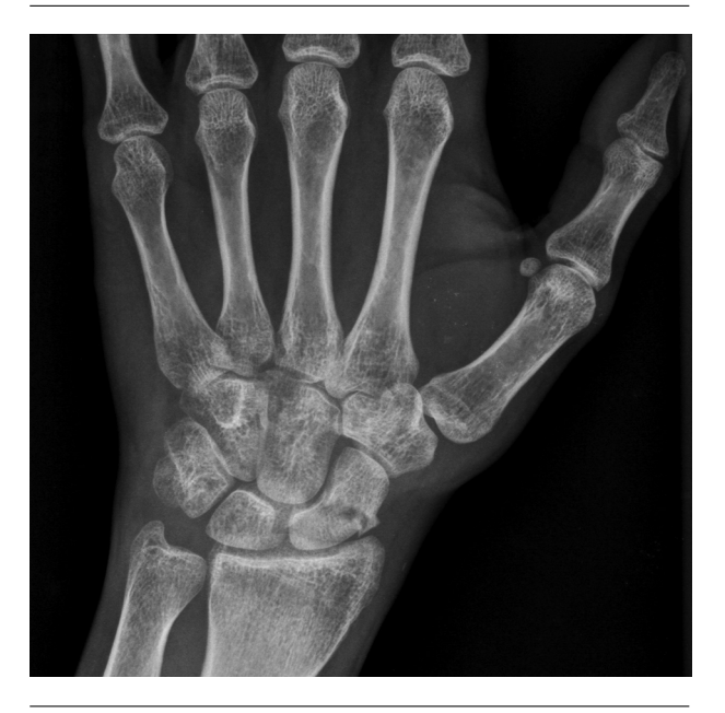
Figure 1. Radiography of the Left Hand Showing a Fracture of a Scaphoid Bone in the Middle Third, with a Line of Separation of 2 mm, Three Months After Sports Fall

tent pain, she went to an orthopedic surgeon for further evaluation. On examination, the pain was elicited when palpating on snuffbox. An X-ray examination was ordered and a fracture of the middle third of the scaphoid with a line of fracture of 2 mm separation was observed (Figure 1). Because there was already 3 months from the accident, a delayed nonunion fracture of the scaphoid was diagnosed, surgical treatment was postponed, and referral to the rehabilitation department was ordered.