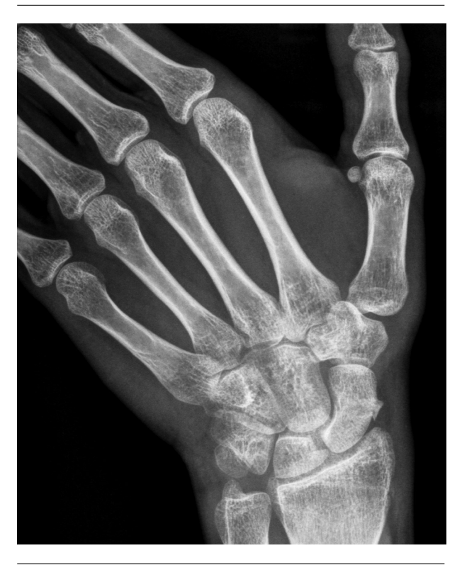
Figure 3. Radiography of the left hand showing consolidation/union of the fracture of a scaphoid bone in the middle third, one month after PEMF (20 sessions, 20Hz-50 Gauss-20minutes, 5 times a week for 4 weeks) and splinting.

inflammatory pathways triggered by osteolysis (16), as it was observed in our delayed union of the scaphoid fracture.