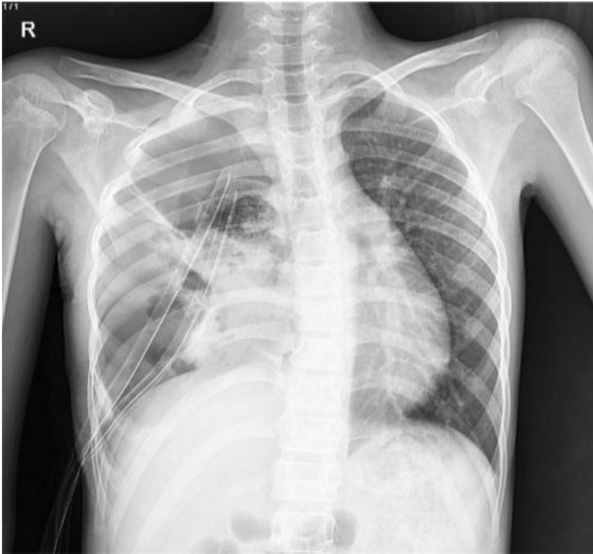
Figure 3. Photograph of the patient's chest after surgery