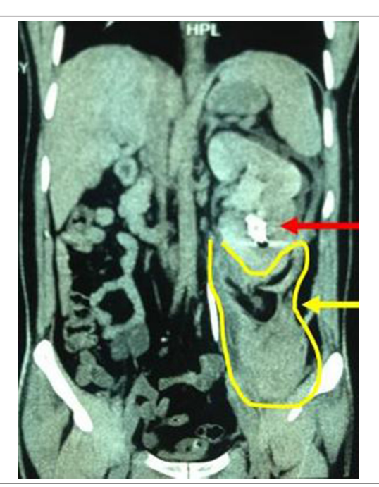
Figure 2. Computed Tomography Substituted by Lower Calyx Reentry Catheter (red arrow) and Giant Retroperitoneal Hematoma (yellow arrow)