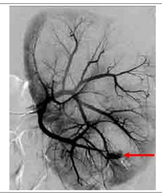
Figure 3. Left Subsegmental Pseudoaneurysm in Super-Selective Renal Angiography