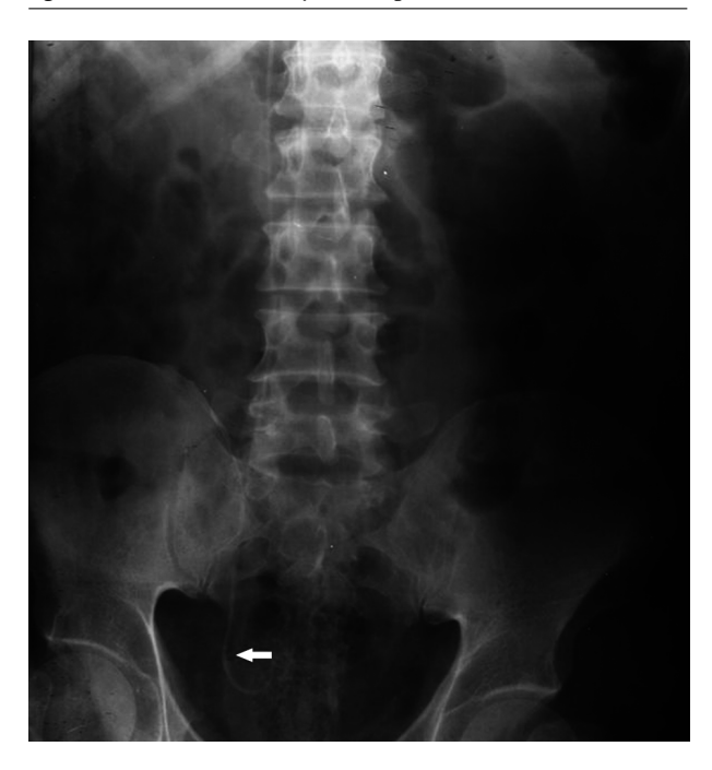
Figure 1. KUB After Placement of DJ Stent in Right Ureter

The X-ray revealed an abnormal pathway of the double-J stent that probably entered into the inferior vena cava. The arrow shows the position of the ureteral stone, 8 \times 6 mm in size, at the ureterovesical junction.