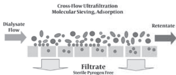
Figure 1. Cold Sterilization Process Based on Ultrafiltration