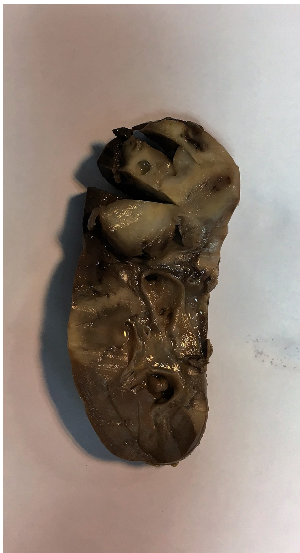
Figure 2. A Round Solid and Cystic Mass in the Upper Pole of the Kidney.

ground were observed. Tumor cells were reactive with vimentin, but nonreactive to all the other markers including cytokeratin, CD56, CD34, desmin, MIC2, MYOD1, SMA, and WT1. Mitotic numbers and proliferative index (Ki67) were very high in the above mentioned tumor cells. No epithelial marker was positive, and no chondroid and osteoid differentiation were identified (Figure 3A - D).