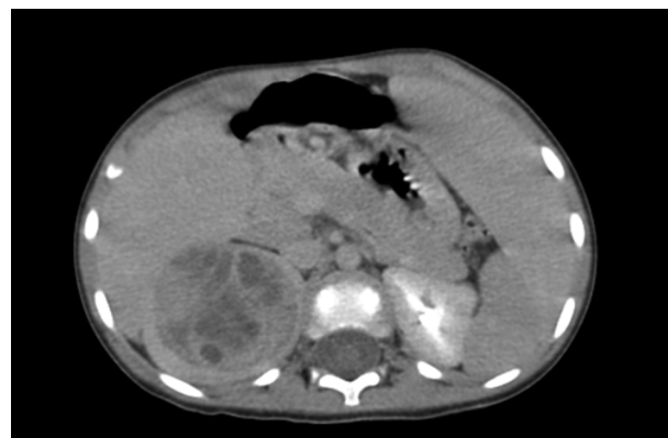
Figure 1. CT Scan Showed a Well-Defined Solid and Cystic Mass in the Right Kidney.

showed a well-defined, solid cystic large mass with no calcification (Figure 1).