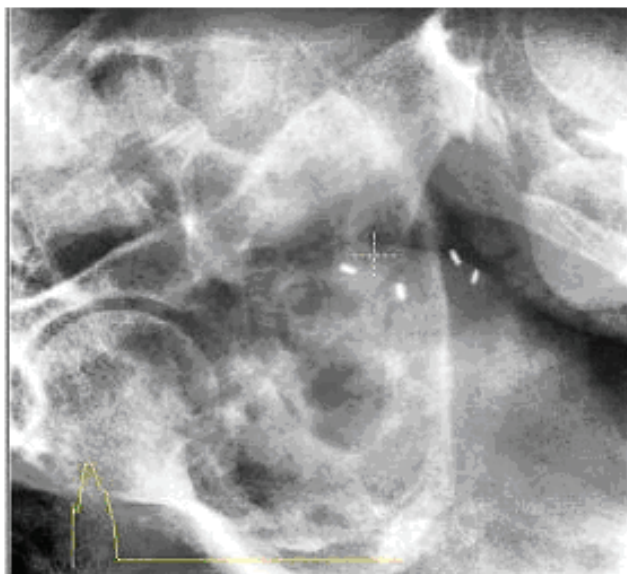
Figure 2. Image obtained with the Exa-Trac system showing the final position of the four fiducial markers