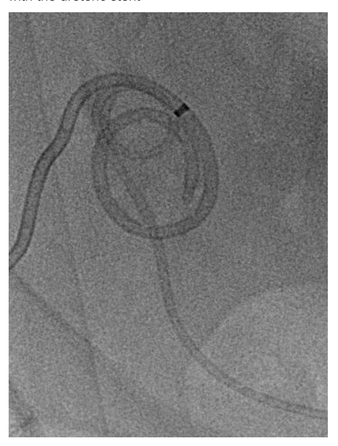
Figure 2. Entanglement of the nephrostomy tube with the ureteric stent

A renal biopsy confirmed persisting acute tubular necrosis (ATN). On postoperative day 21 enterococci were isolated from the nephrostomy and she was commenced on Vancomycin. The nephrostomy was accidentally dislodged again on the 25th postoperative day and the creatinine level that had decreased to 264 µmol/L on the previous day began to rise. The nephrostomy tube was reinserted on the 27th postoperative day with the drainage of a large amount of pus, which yielded multiply resistant enterococci on culture. She was also commenced on Linezolid and Meropenem. With these measures, her creatinine level decreased to 192 µmol/L and her GFR rose from 12 to 22 ml/min. After three weeks of improving GFR and creatinine levels, an antegrade ureteric stent was placed radiologically and the nephrostomy tube removed. She was discharged home on day 62