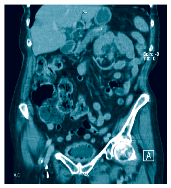
Figure 2. A Coronal CT without intravenous contrast showing a thickened bladder wall with intramural air (arrows) consistent with emphysematous cystitis.

non-specific clinical symptomatology. It predominantly affects middle-aged women with comorbid disorders including diabetes mellitus or immunocompromised hosts, but can also occur in healthy individuals. Other predisposing factors to EC include chronic UTIs, indwelling urethral catheters, urinary tract outlet obstruction, or as in the case patient, a neurogenic bladder (5, 6). The most common pathogen that causes EC is Escherichia coli (58%), followed by Klebsiella pneumonia (21%) as well as Enterobacter spp, Clostridium spp and rarely candida (5). Although the disease might be suspected based on history and physical, definitive diagnosis is usually made on plain radiographs or CT scans of the abdomen when air is visualized within the walls of the bladder. Although the incidence of EC is felt to be relatively