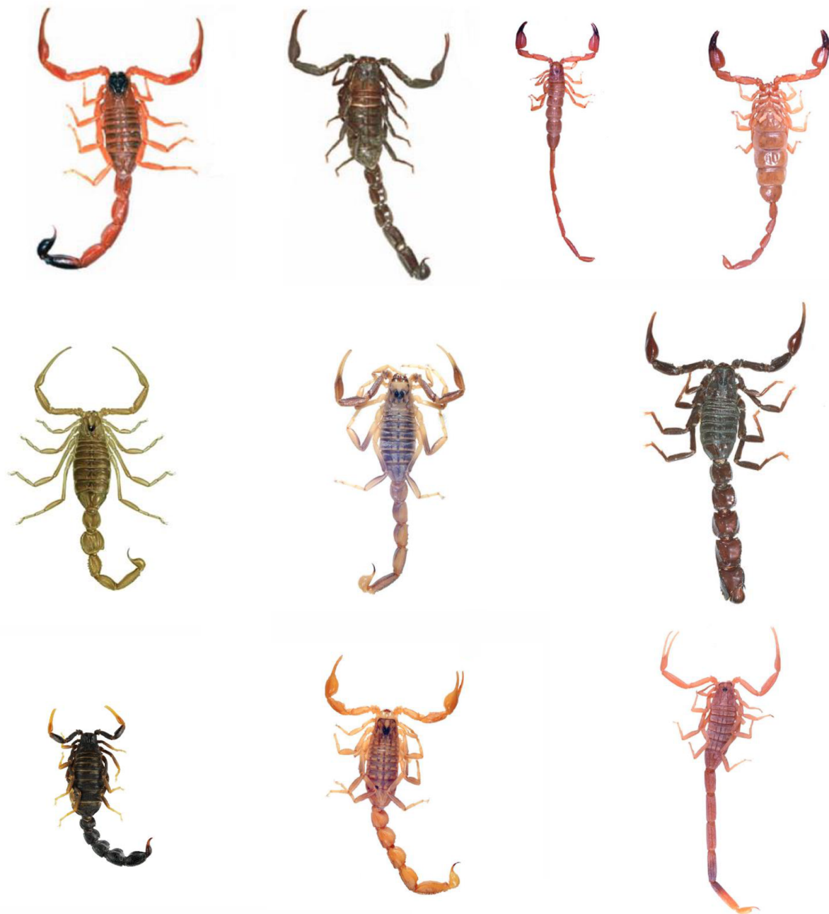
Figure 1. The medically important scorpions in Iran; First row: Hotentotta saulcyi , Hotentotta zagrosensis , Hemscorpius lepturus (male and female). Second row: Apistobuthus susanae , Odontobuthus doriae , Androctonus crassicauda . Third row: Orthochirus iranensis , Mesobuthus eupeus , Compsobuthus matthiesseni , Me