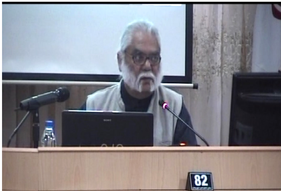
Figure 2. His workshop entitled "Emerging Issues in Urban Traffic Safety" at the International Road Traffic Injury Seminar, Challenges and Future Solution held in Health Policy Research Center, Shiraz University of Medical Sciences, Shiraz, Iran.