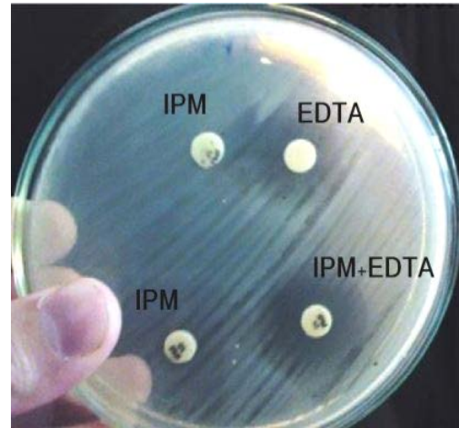
Figure1. Detection of MBL production with imipenem-EDTA combined disk in down and imipenem-EDTA double disk synergy test in top

Minimum inhibitory concentration and minimum bactericidal concentration of propolis ethanol extract against of P. aeruginosa and S. aureus strains were showed in table 2.