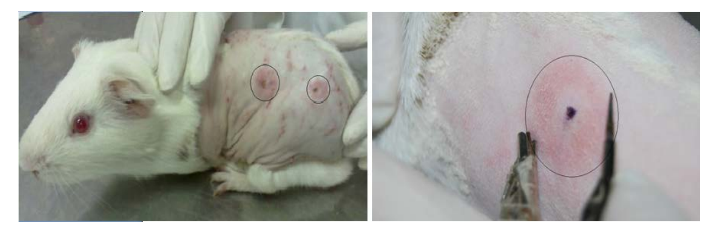
Figure 1. The red sign around the injection point 24 hours after intradermal injection