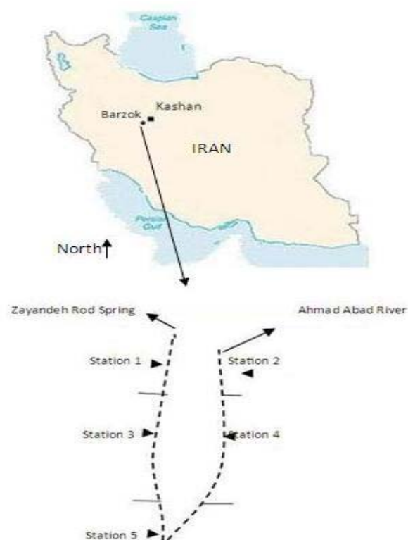
Figure 1. Locations of sampling stations in Barzok

Statistical analysis of data showed that there is a significant relationship between the reduction of pesticide residues with over time ( p = 0.001 ). Also there is interaction effect between the pesticides studied, in other word reduction rate of pesticides with over time is not the same and reducing rate diazinon was less than chlorpyrifos (Table 2). Percent reduction diazinon and chlorpyrifos relative to first day of spraying based on the sampling stations shown in the table below: The results shown that the reduction rate of diazinon and chlorpyrifos regardless of the sampling stations in the first week of spraying compared with the first day of spraying was 64.7 and 30.3%; respectively, in the second week of spraying compared with the first day was 83.1 and 85.1%, and at the first month to the first Day was 88.8 and 95.9% (Figure 2).