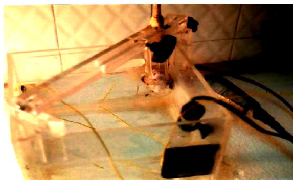
Figure 1. View of the ultrasonic exposure setup containing rats

*One unit (U) contains 0.56-0.66 mg of bleomycin