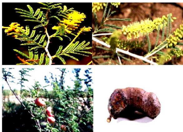
Figur. 1: Prosopis farcta

Cutaneous holes healing process in non-diabetic rat treated with Prosopis farcta fruit husk powder were reported significantly faster than the control group [14]. Also, Prosopis farcta plant root extract increased expansion rate of aorta [15]. As a result, since using natural compounds has lower side effects comparing to chemical substances and also regarding the antidiabetic, anti-inflammatory, and healing effects of different parts of the plant - the effects of the fruit husk powder and root aquatic extract of Prosopis farcta on the healing process of diabetic rats were examined in this study.