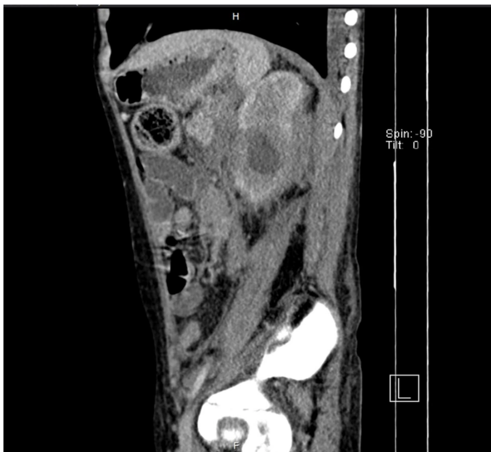
Figure 1. Contrast-enhanced CT demonstrating a retroperitoneal mass compressing major vessels and surrounding structures in the presented case.