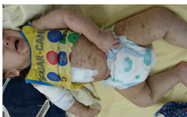
Figure 1. Diffuse Hyperpigmented Subcutaneous Nodules

toms other than intermittent fever for a few weeks after the primary illness. Few weeks later, diffuse cutaneous lesions appeared primarily in lower extremities. His lesions presented as macules which progressed to subcutaneous nodules (Figure 1).