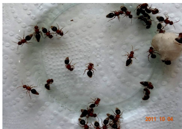
Figure 3. It shows 30 live females of Dentilla dehghanii sp. nov., (photo prepared by Dehghani and Kassiri).

width to the pronotum. Males are 7.2 to 9.9 mm long, with head width equal to mesosoma width (Figure 4).