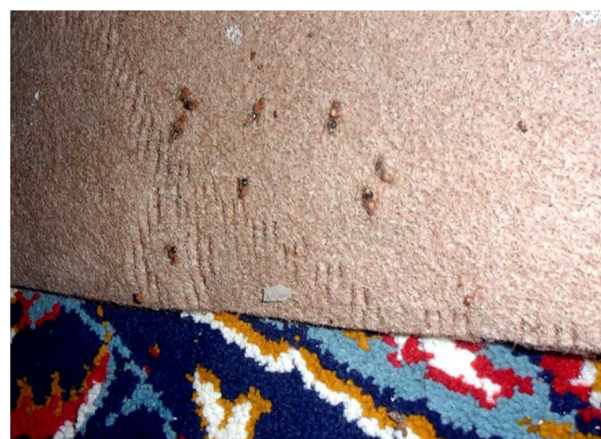
Figure 5. Dead velvet ants of the new species of Dentilla dehghanii sp. nov., after the use of pesticides in the reception and sleeping rooms in Kashan-Iran

The stung individuals complained of severe pain, especially in the first 8 hours at the sting site. Pain and itching in the stomach were sometimes mild, lasting for 3 - 4 months. Occasionally, stings have occurred from under the bed sheet or on trousers. The bedrooms were sprayed with pesticide due to the frequency of velvet ants (Figure 5).