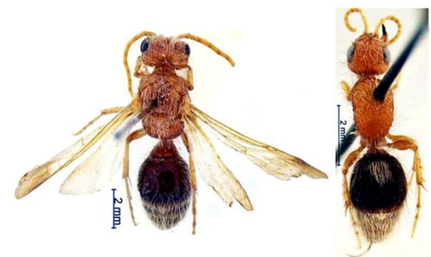
Figure 4. Female (right) and male (left) of Dentilla dehghanii sp. nov., (photos prepared by Lelej 2025)

This sting caused severe pain, itching, and redness of the skin that persisted for about a week in the victims.