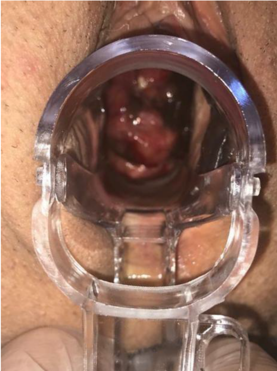
Figure 1. A black pigmented cervical mass which extended to vaginal wall and vulva.