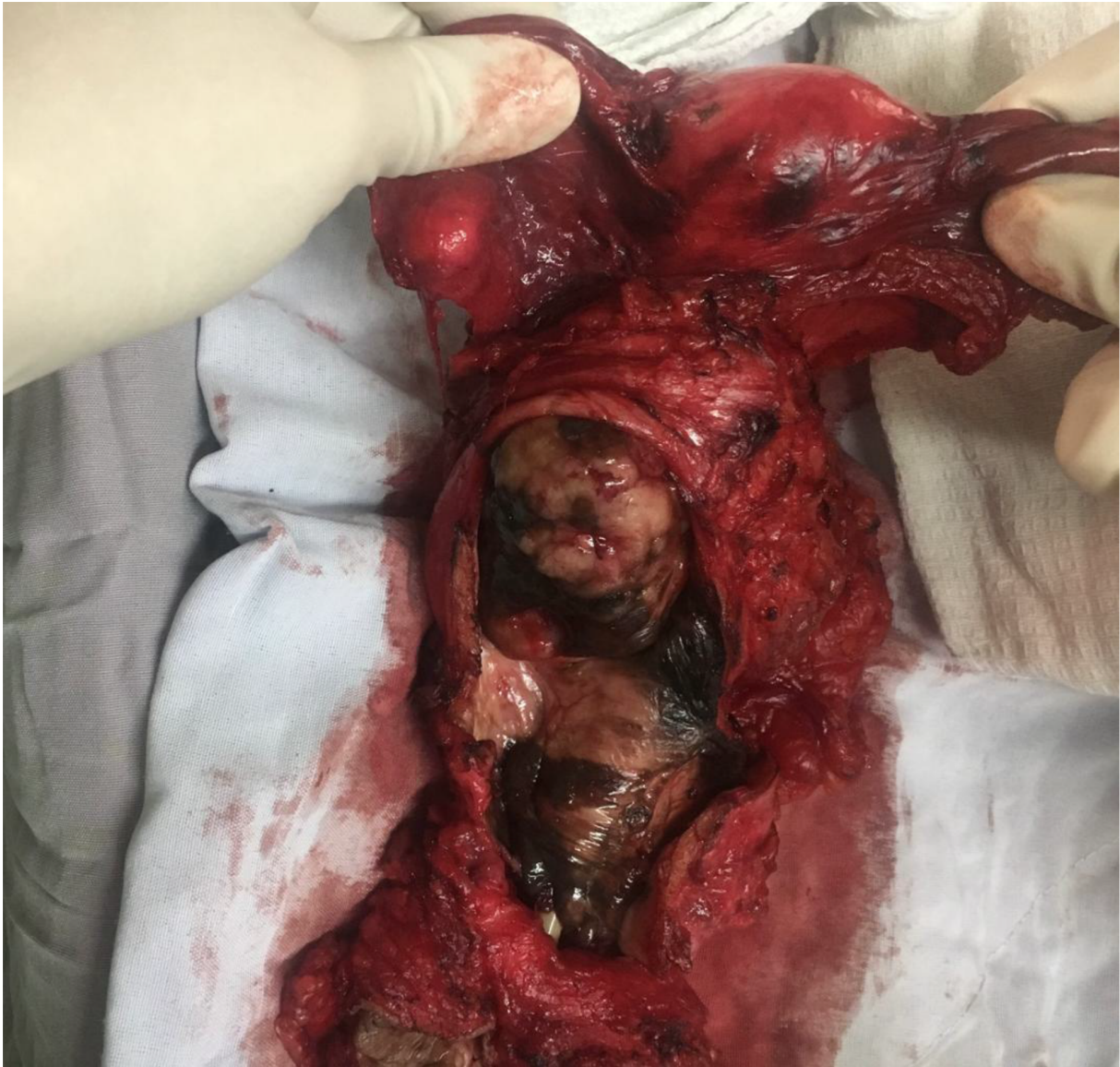
Figure 3. Anterior pelvic exenteration specimen showed cervical blackish mass with multiple small blackish pigmented lesions throughout the vaginal wall and vulva.