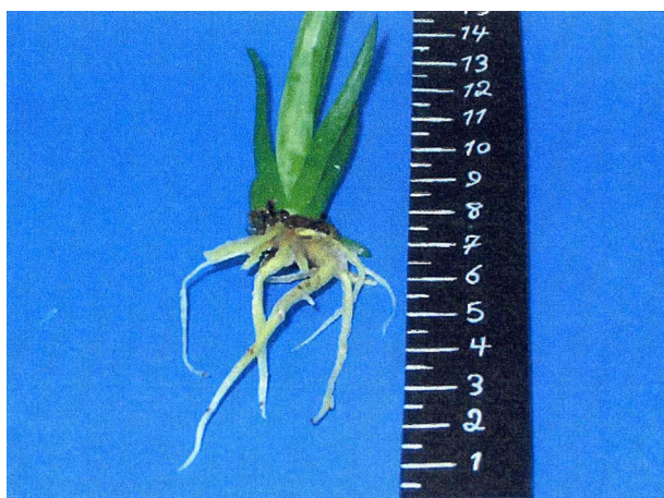
Figure 2. The Rooting of Proliferated Shoots in MS Medium Containing 0.5 mg/L IBA

a Values Followed by the Same Letter in Each Column Are Not Significantly Different ( P < 0.05 ) Using DMRT