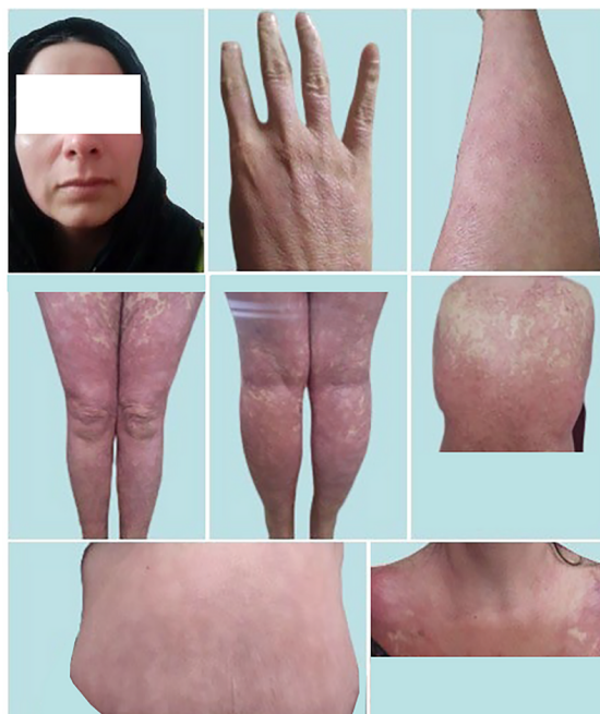
Figure 5. Post-treatment skin images of (top) improved face/extremities lesions (middle) posterior skin lesions, anterior lower extremities, posterior lower extremities (bottom) improved abdominal/chest EP lesions (20 October, 2023).

and hand skin. In November 2023 and afterward, following InflAQ treatment, the patient experienced complete relief and showed significant improvement in the primary/EP skin lesions (Figure 6), achieving remarkable normalization of the skin.