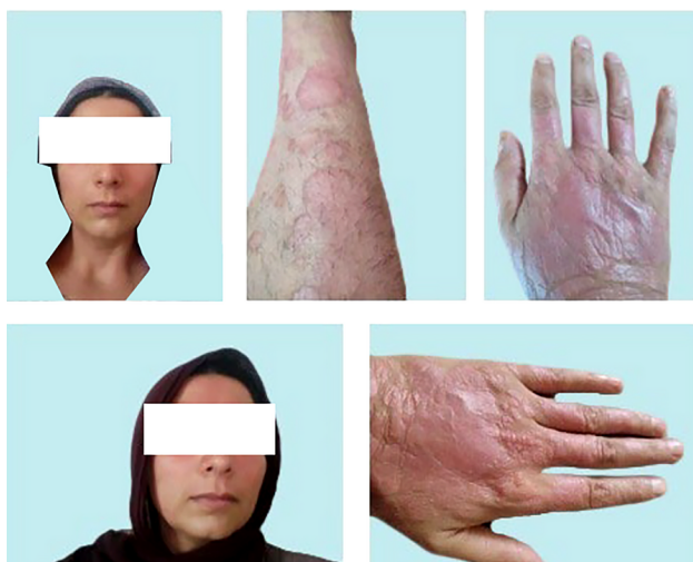
Figure 2. Post-treatment skin images of face lesions (top/bottom, left images), and lower/upper extremities (other images), about one month (late July, 2023) after the first intervention attempt using InflAQ (twice a day), along with Vaseline/Petroleum jelly (twice a day) as an emollient.

visible (e.g., on the face, scalp, hands, or nails) and/or therapy-refractory regions are affected, psoriasis can be assessed as moderate-to-severe, even if the affected BSA is 10. The above statements and the patient status (EP) (23) were indications for systemic treatment. However, despite showing indications for systemic treatment between September and October 2023 (Figures 4 - 5), the patient refused systemic treatment and insisted on