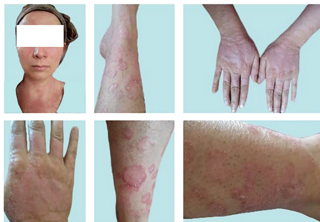
Figure 1. Pre-treatment skin images of face/neck lesions (top, left image), and lower/upper extremities (other images). In that time (early July, 2023) and long before the intervention with InflAQ, the patient was only using vaseline/petroleum jelly (twice a day) as an emollient and had absolutely preferred not to use any usual disease-modifying topical treatment. She accepted this type of intervention (InflAQ included in cream base, USP/BP), which is only based on the natural compound. Her daily living activities were severely affected (for several years) by the burden of widespread psoriatic skin lesions (only in face/neck/extremities, almost with no itching).