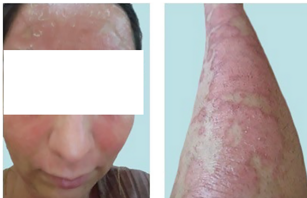
Figure 3. Post-treatment skin images of face lesions (left), and (representative) lower extremity (right), ~ 2 months (late august, 2023) after the first intervention attempt using InflAQ (twice a day), along with vaseline/petroleum jelly (twice a day) as an emollient.