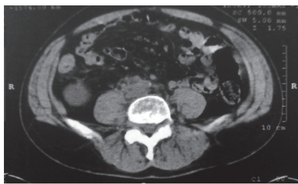
Figure 2. Solid Mass (Arrow) in the Right Paraaortic Area

of Cytarabine 200 mg/m 2 days 1-5 (IDA/Ara-C 2 + 5 regimen) and a prophylactic intrathecal chemotherapy of 100mg Cytarabine on day 3 (cerebrospinal fluid examination was normal). The CT scan for restaging demonstrated a partial remission of the right paraaortic lesion (2 cm in width) and the JJ stent was removed. A further induction-consolidation cycle of high-dose Ara-C followed. Thereafter, the CT scan demonstrated a complete remission of the right paraaortic lesion.